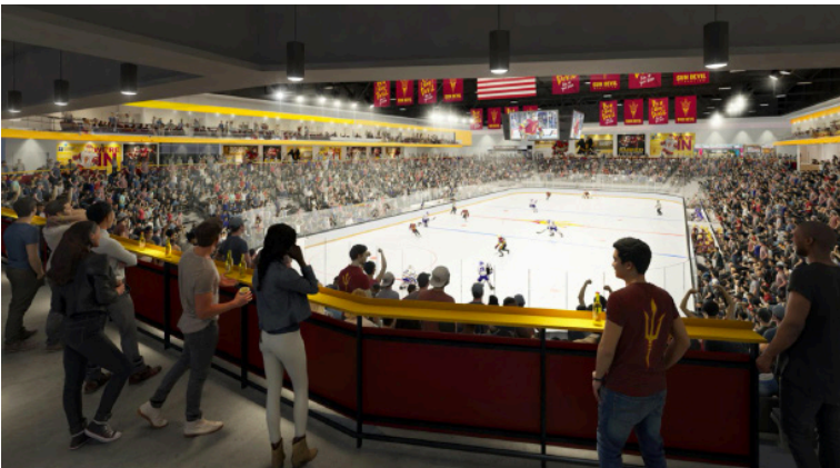
VIEW FROM MAIN CONCOURSE