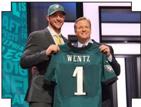
Carson Wentz (North Dakota State)