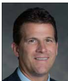
Steve Alford Head Coach 4th Year at UCLA 26th Year Overall