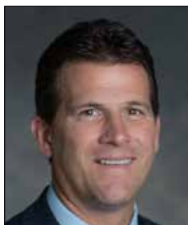
Steve Alford Head Coach 4th Year at UCLA 26th Year Overall