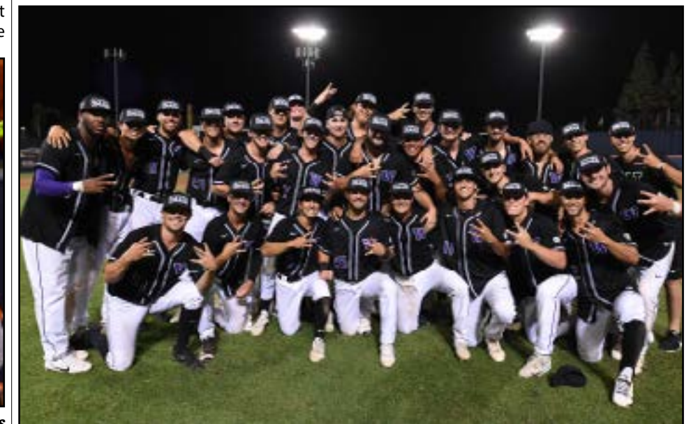
The 2018 Huskies after beating Cal State Fullerton to advance to the program's first CWS.